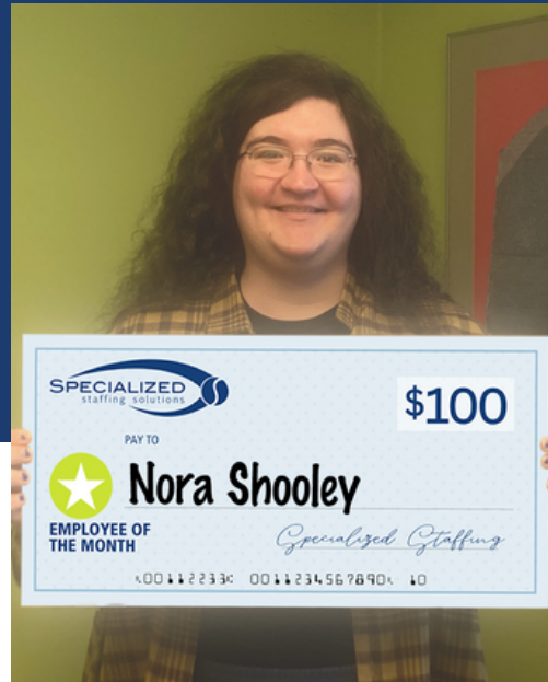
Every month, each branch of Specialized Staffing Solutions recognizes and rewards an outstanding associate, Employee of the Month, that exemplifies our core values.