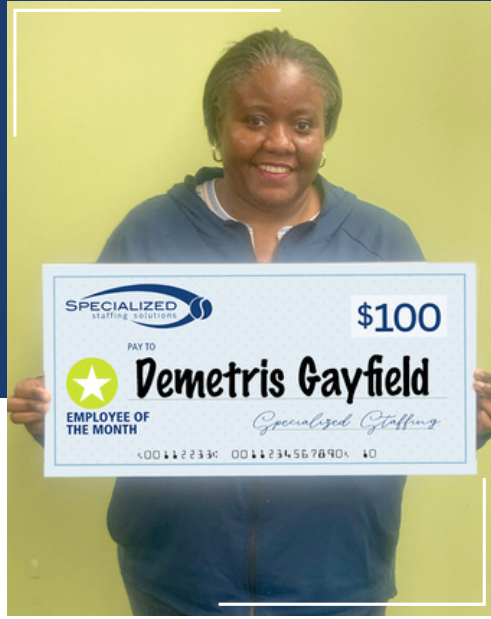
Every month, each branch of Specialized Staffing Solutions recognizes and rewards an outstanding associate, Employee of the Month, that exemplifies our core values.