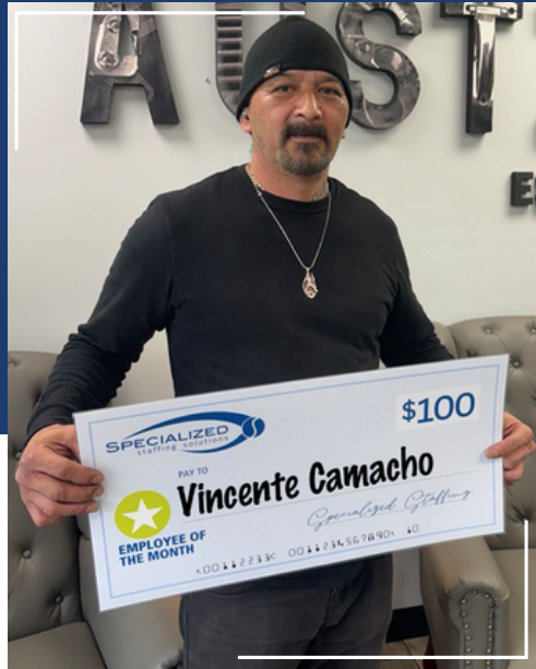
Every month, each branch of Specialized Staffing Solutions recognizes and rewards an outstanding associate, Employee of the Month, that exemplifies our core values.

Arrives early, has the can-do attitude, willing to do whatever it takes, willing to do whatever you need done, and impressed me immensely on day 1. I needed some organization done and I showed him what I wanted 1 pallet and bin location to look like. He had aisles of them done that day. I used his hard work and cleanliness as the standard and expectation moving forward for my entire team, in our daily morning warm up meetings. Thanking him and giving him all the credit for how well the area looked.