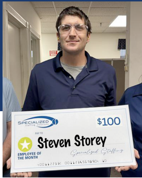
Every month, each branch of Specialized Staffing Solutions recognizes and rewards an outstanding associate, Employee of the Month, that exemplifies our core values.