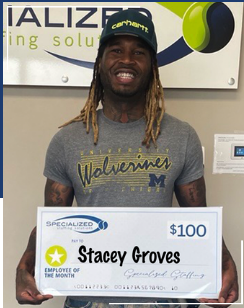
Every month, each branch of Specialized Staffing Solutions recognizes and rewards an outstanding associate, Employee of the Month, that exemplifies our core values.

He was just recognized in our leadership meeting for doing an excellent job staying busy, on-time, learning different areas within his department.