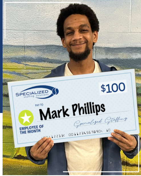
Every month, each branch of Specialized Staffing Solutions recognizes and rewards an outstanding associate, Employee of the Month, that exemplifies our core values.