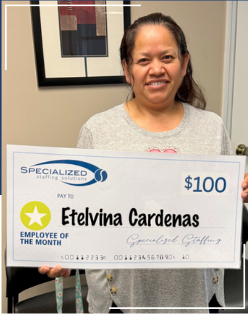
Every month, each branch of Specialized Staffing Solutions recognizes and rewards an outstanding associate, Employee of the Month, that exemplifies our core values.