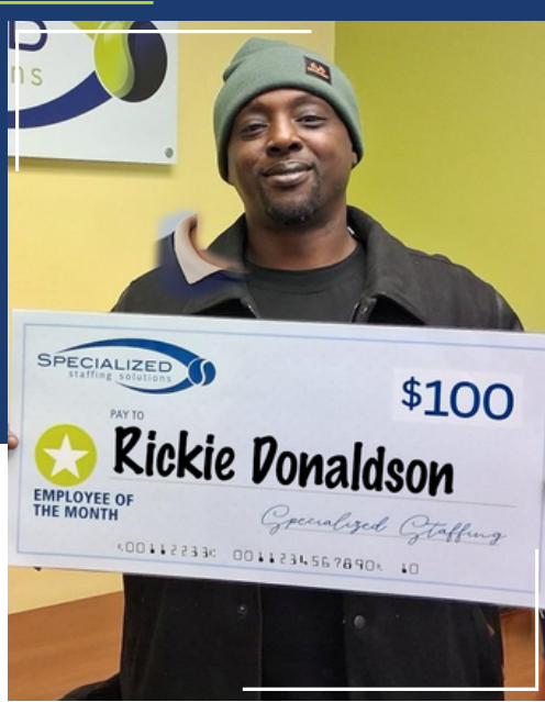
Every month, each branch of Specialized Staffing Solutions recognizes and rewards an outstanding associate, Employee of the Month, that exemplifies our core values.

“ He has been coming in on 1st shift, covering overtime, and doing some cross-training. ”